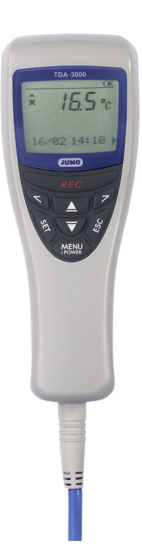
TDA-300 (Type 702540/...) TDA-3000 (Type 702541/...)